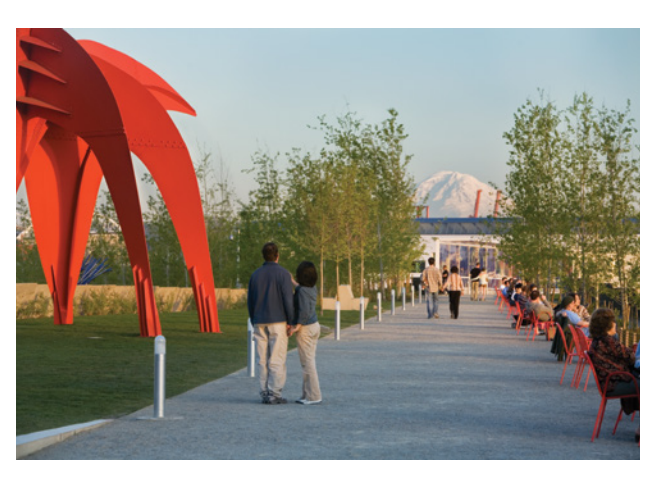
The Eagle, 1971, Alexander Calder.