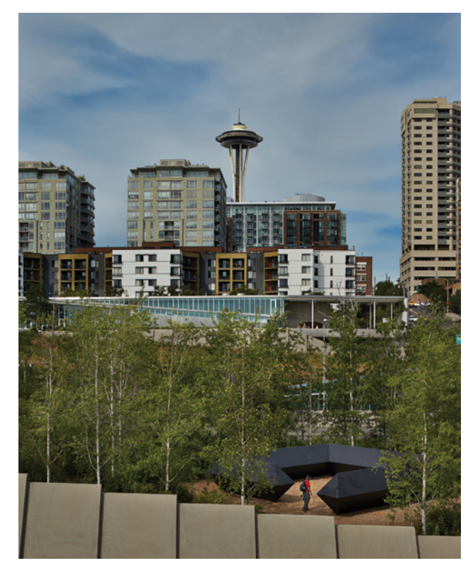
View of Tony Smith's Stinger through the Henry and William Ketcham Families Grove.

SAM proudly supports a healthy and sustainable green space through incorporation of native plants in the park, monthly beach cleanups by volunteers, reduction of chemicals and pesticides in our landscaping, and efficient irrigation with a time- and weather-based watering system. We make it easy for visitors and staff members to recycle waste, to compost food and plant material, and to use public transit, carpools, or bicycles to get to the park.